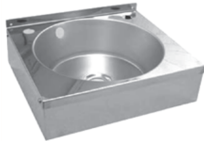
B1202 - Small Basin 400x350mm