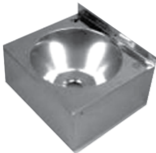
B1203 - Mini Basin 300x265mm