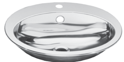
B1205 - Oval Inset Basin 529x454mm (1 taphole, mirror- polished)