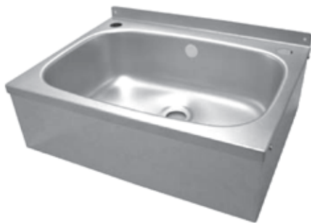
B1201 - Standard Basin 490x370mm

Manufactured from 1mm thick grade 304, satin polished stainless steel, supplied with two tapholes and 32mm waste fittings (unless stated otherwise).