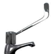
T9211 - Quarter turn 150mm lever taps

L1298 - Stainless steel leg supports 700mm high