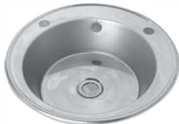
B1206 - Circular Inset Basin 425mm dia.