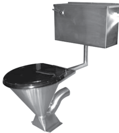
W1001 - Pedestal WC Pan - P trap W1002 - Pedestal WC Pan - S trap 335x485x410mm high C1195 - Low level cistern 498x186x295mm high W1099 - Black plastic seat and cover

WC pans are manufactured from 1.6 and 2mm thick grade 304, satin polished stainless steel, with security flushing rim, 76/102mm diameter plastic pan connector and 38mm diameter flushpipe connection. Cisterns and flushpipes are manufactured from 1.2mm grade 304, satin polished stainless steel, with plastic cistern fittings.