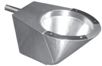
W1005 - Wall-mounted WC Pan - P trap 350x490x345mm S1188 - Black polypropylene seat pads