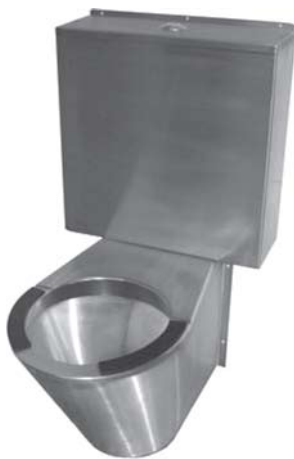
W1008 - Close-coupled WC Suite 350x640x867mm high S1188 - Black polypropylene seat pads