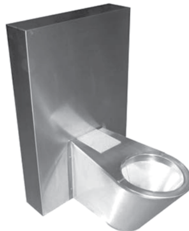
W1010 - Rear-panelled WC Suite 350x625x1030mm high