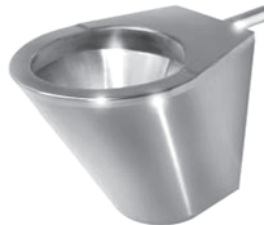
W1003 - Shrouded WC Pan - P trap 350x490x390mm high W1004 - Shrouded WC Pan - S trap 350x640x390mm high