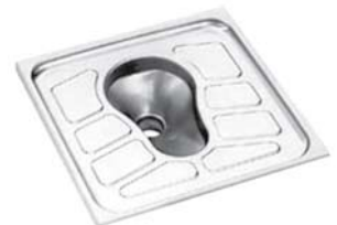
W1011 - Squatting WC Pan 110 spigot 700x700mm